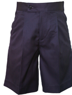
Shorts Primary Navy