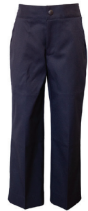
Trouser Navy Double Knee