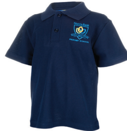
Polo Short Sleeve