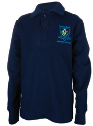
Long Sleeve Polo