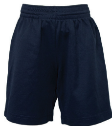
Sport Shorts Navy